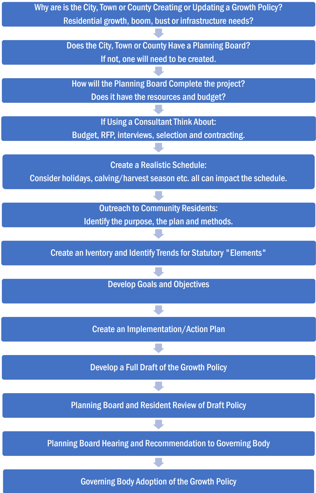
Figure 1 - Typical Process for Developing a Growth Policy